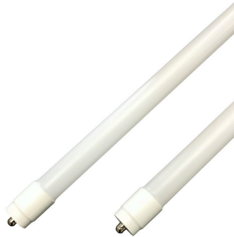
L x D = 95" x 1"