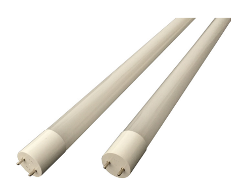
L \times D = 47.75'' \times 1''