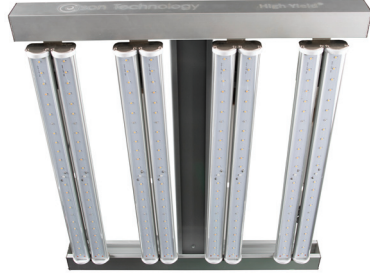
L x W x H = 25" x 23.25" x 3"