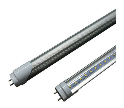
L \times D = 35.75'' \times 1''