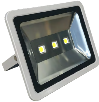
L x W x H = 17" x 13" x 7"