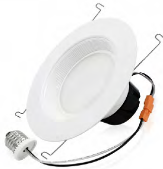
L x D = 3.5" x 5"