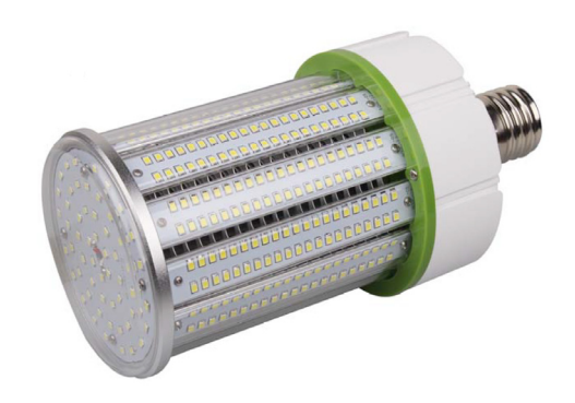
L \times D = 10.5" \times 5.25"

Carson's 82W LED corn lamp emits 9,092 lumens with 360° illumination performance equal to 150W high pressure sodium lamp. An E39 mogul screw base retrofits into sockets which bypass the ballast and run directly off line voltage. Suitable for indoor or outdoor applications such as high bay or shoe box retrofits.